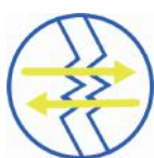
Super Tear Strength