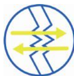
Super Tear Strength