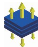
Super Tensile Strength