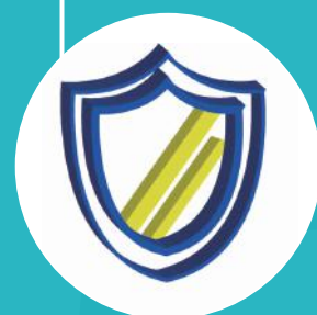
Super Adhesion Strength