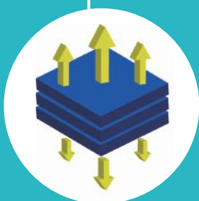
Super Tensile Strength